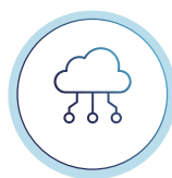
Managed Service Provider (MSP)