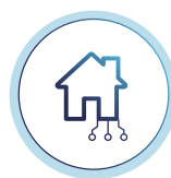
On-Premise Data Centre